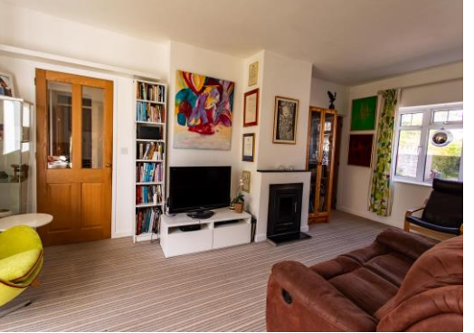
sink set in a vanity unit with storage under and a mirrored cabinet over, a further airing cupboard provides useful storage on slatted shelves.

Shower Room: 7' 11" x 7' 10" (2.41m x 2.39m) A walk in glass shower enclosure has shower panels to the walls and a Mira electric shower. There is a heated towel rail, double glazed window to the side, a low level W.C, a